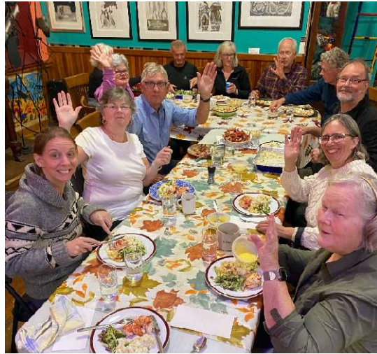
Sometimes the road has true companions.

The last few steps of Camino Nova Scotia.